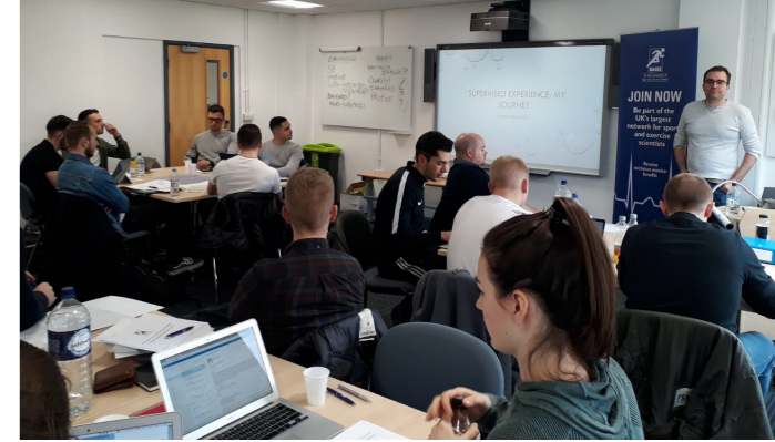
Above: BASES Division Days have been very popular, with over 300 members taking advantage of our annual free members-only events