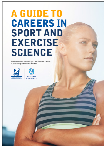
Above: BASES launched its new Guide to Careers in Sport and Exercise Science in 2018, providing guidance, information and advice

The Sport and Exercise Scientist continues to be rated highly by members in the BASES membership feedback survey. This year there has been a good mixture of sourced articles and those submitted by BASES members. In the past year there have been a number of changes to the composition of the Editorial Advisory Board, which now comprises of 11 members. BASES published three new expert statements in 2018 on the following topics: The Process and Outcomes of Developing Exercise ; Guidelines for Adults with Spinal Injury ; Exercise Training for People with Intermittent Claudication due to Peripheral Arterial Disease ; and The Role of Breakfast-Physical Activity Interactions for Energy Balance and Metabolic Health .